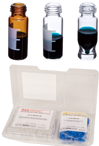
Convenient Easy Purchase Pack Available.

RSA™ vials & inserts made with Reduced Surface Activity glass (RSA™) were developed for the separations laboratory that investigates low abundance analytes or samples that are pH sensitive, basic in nature or when using mass spectrometers. Chosen when coatings or silanization is not sufficient or counter indicated for good results such as with LCMS, GCMS or UHPLC. For samples, ordering or technical information, please inquire or visit our website.